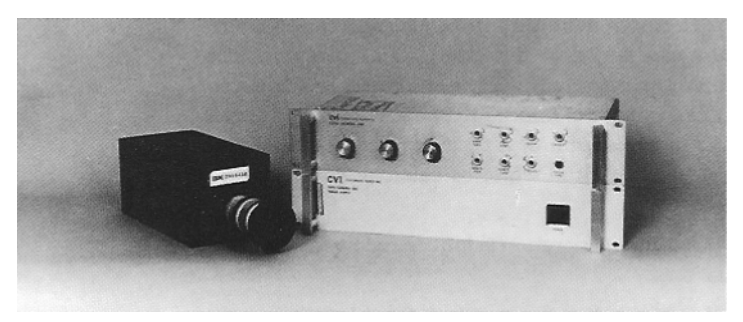
CVI Data Camera, 1970.