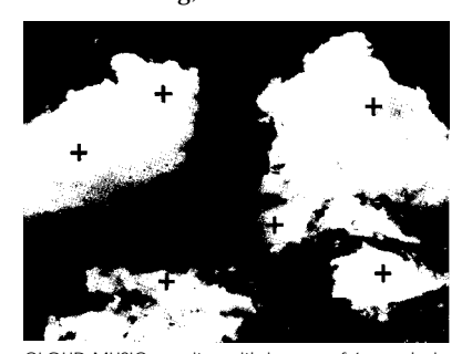
CLOUD MUSIC monitor with image of 6 crosshairs amidst lively cloudscape.

Like sailing, the music is weather-dependent."