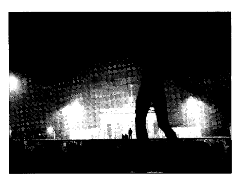
Brandenburg Gate and Berlin Wall, from West Berlin. In silhouette, sculpture welcoming East Berliners.