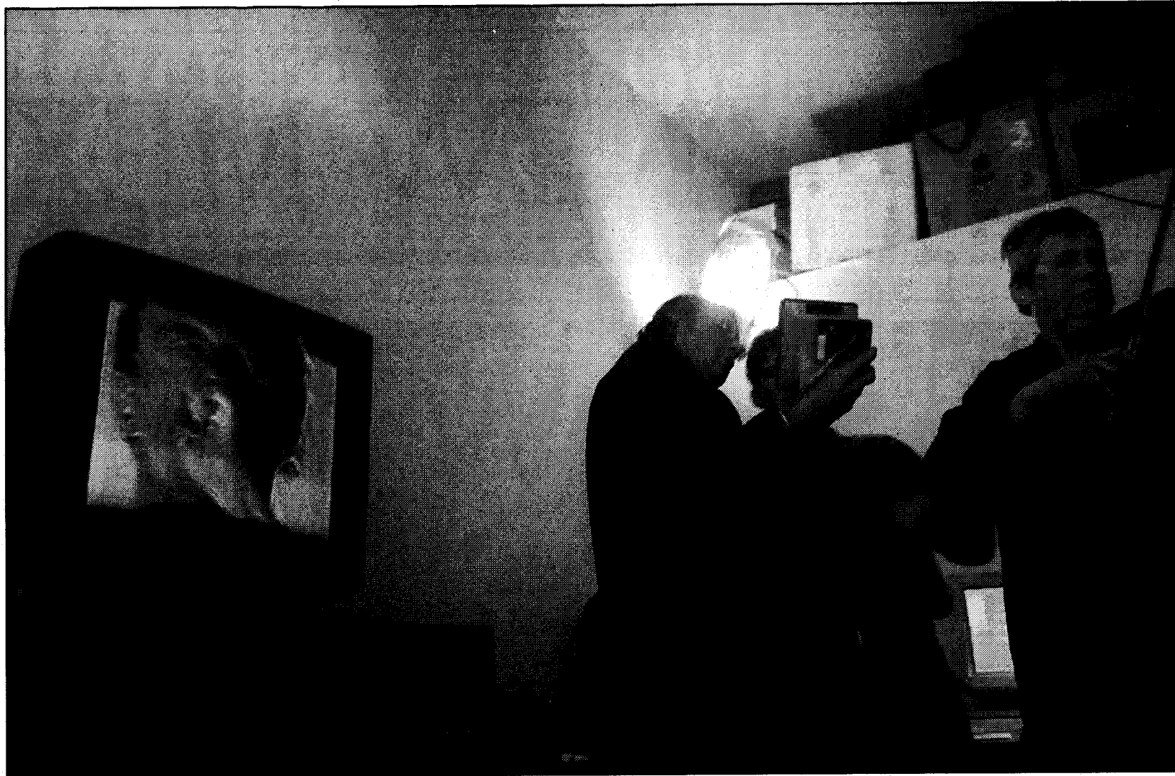
As violinist Steina Vasulka performs, she manipulates the image on the nearby monitor.