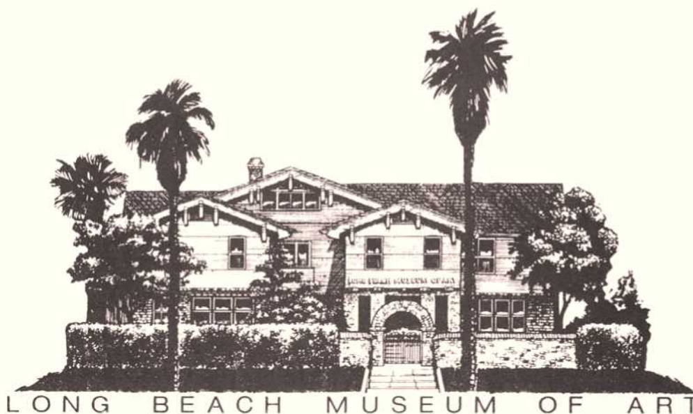
LONG BEACH MUSEUM OF ART

The Video Council is a membership organization open to all. The Council is involved in a range of activities and responsibilities which promote the development of the Museum's media arts program. The Council's executive board, made up of prominent artists and producers, functions as advisors to the Museum's program and liaisons with the media arts community. The Council supports the program's activities which include exhibitions, screenings, lectures, performances, and workshops. In addition, the Council distributes, to its members, a Media Arts newsletter of interest to artists, producers and presenters.