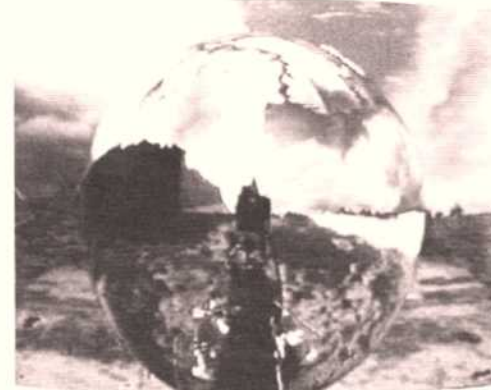
THE WEST