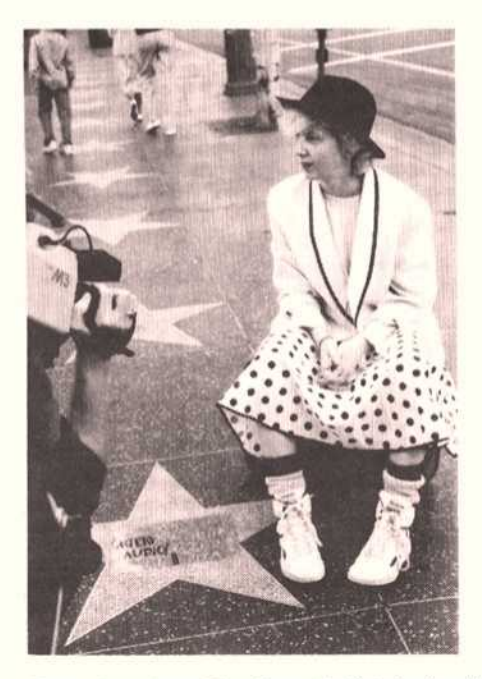
Frames from Paper Tiger Scans the (Inter)national Audio/Video Fe$tival (1986), by Paper Tiger Television.