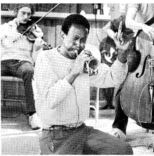
Master Artist In Residence, November 1984 Don Cherry, jazz musician