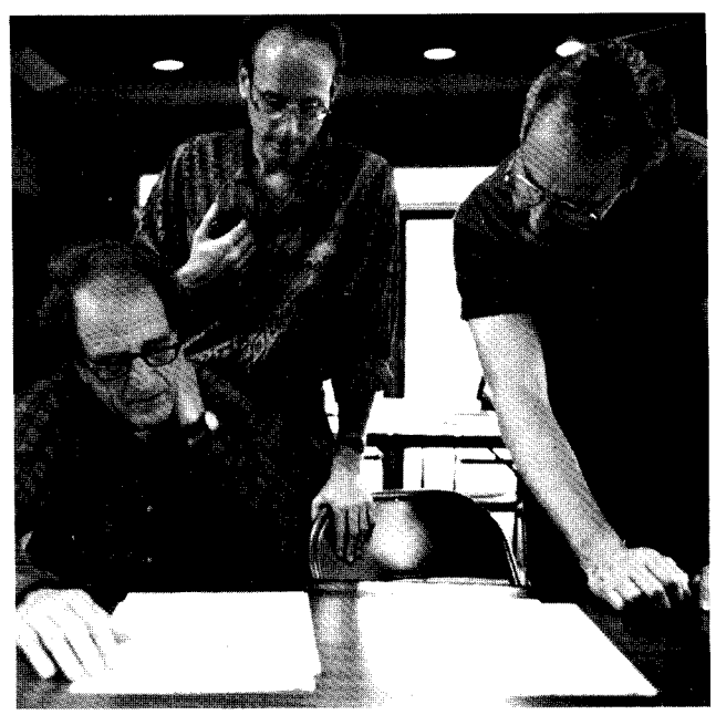
Master Artist In Residence, Lukas Foss with Associates, January 1991