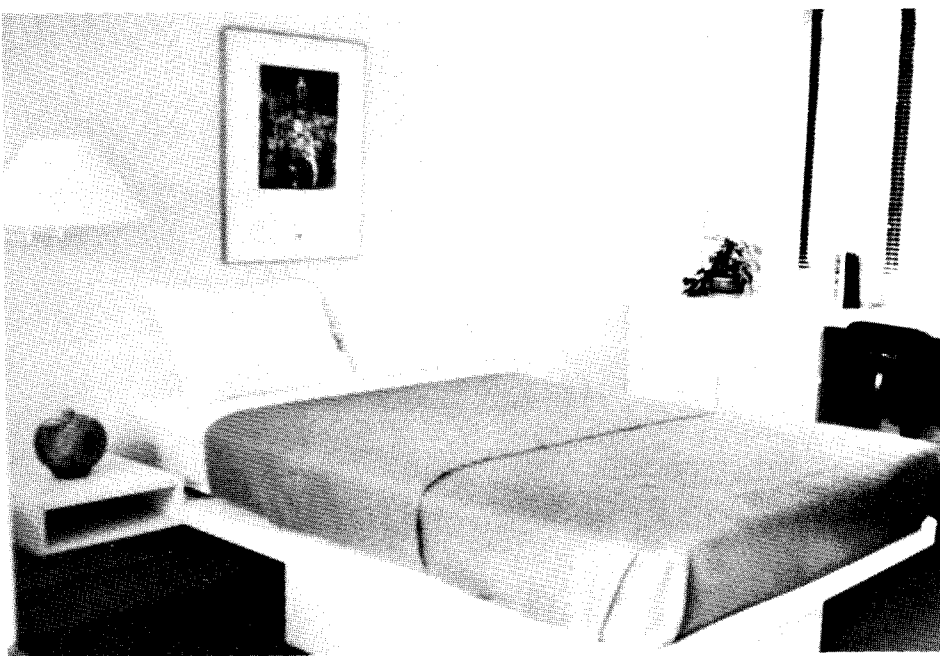
Room in Associate Housing